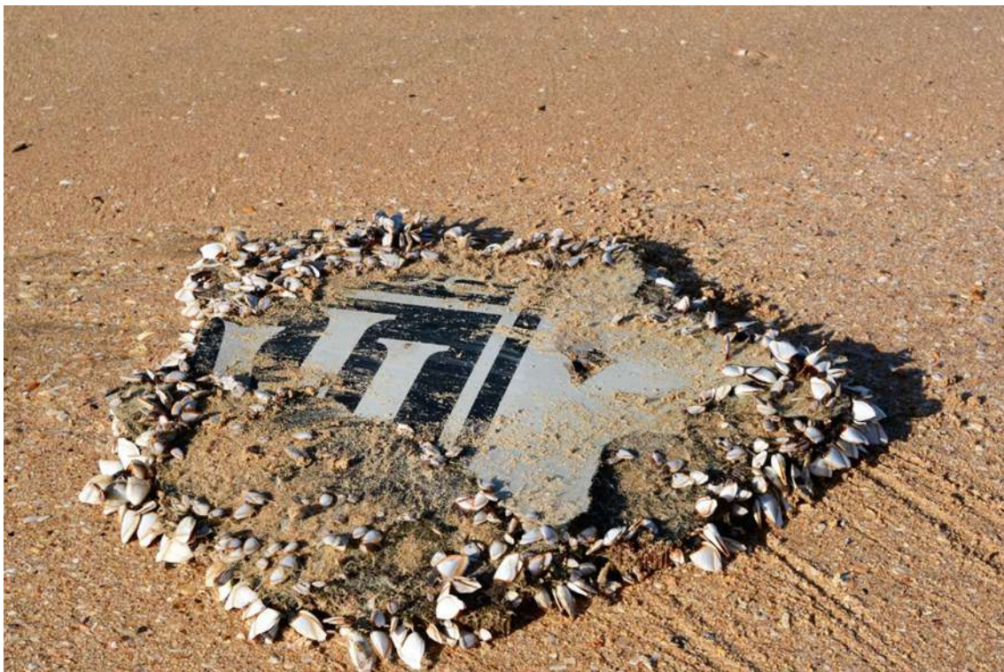
Figure 3: Photograph taken 23 Dec 2015 showing Part No. 3 significantly colonised by barnacles